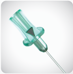
Needle bevel indicator