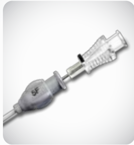
Clear needle hub